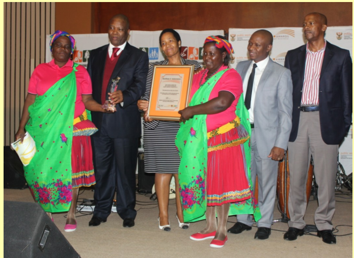
Best Innovative Project Hluvukani Jerome Day Care Centre