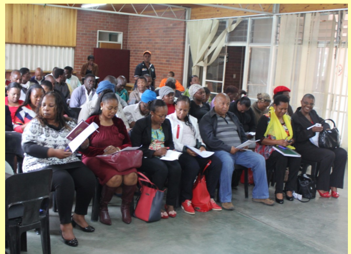
Contractors around Capricorn District Municipality listening to presentations during the outlining of programme