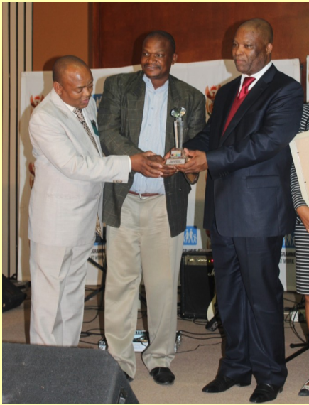
Best Project Local Municipality Blouberg Municipality Waste Management

The Limpopo Department of Public Works as the coordinator for EPWP in the province has awarded the following projects: