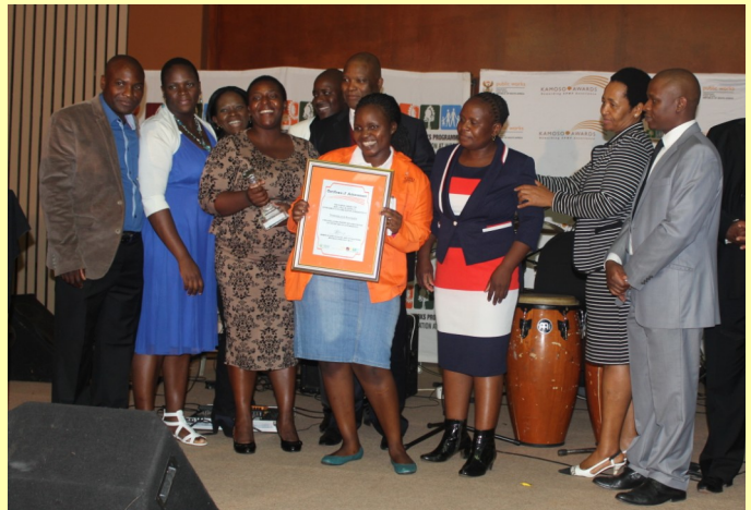
Best Local Municipality THulamela Local Municipality