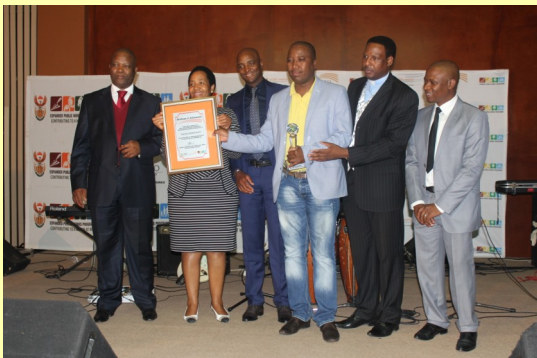
Best infrastructure Department Department of Roads and Transport