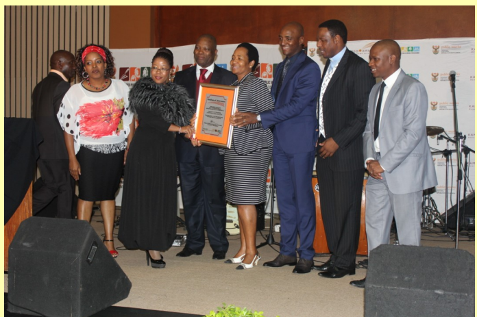
Best Construction Project Polokwane Local Municipality